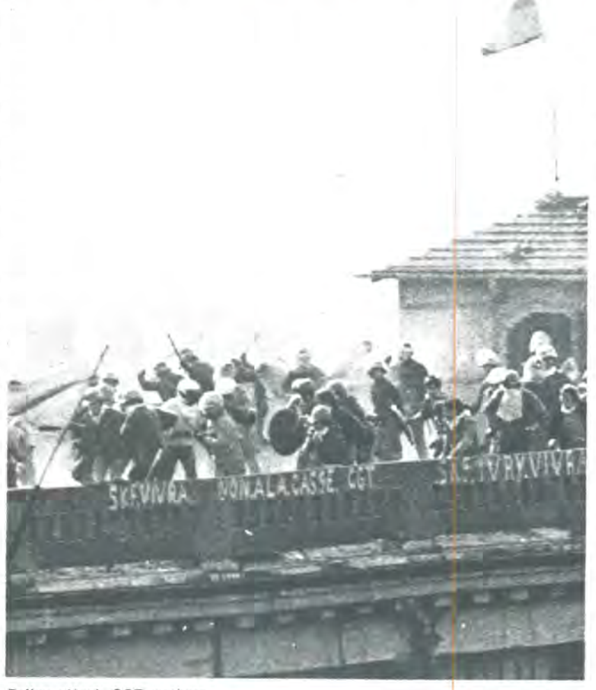
Police attack CGT workers

Until July 1984, the French Communist Party (PCF) had four ministers in the government. As the Table shows, the working class