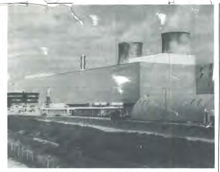
Storage tanks at Sellafield : source of the leaks?