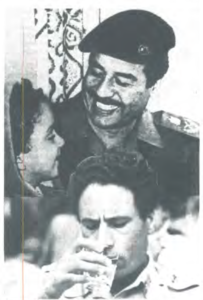
Hussein (above) and Gadaffi

There is no essential difference between this analysis of the YCP and CCP and Pablo's. In the same document the usual catastrophism is mixed in with the belief that in Britain the traditional reformist leaderships "are being seriously challenged". While the SWP are mildly warned that "a diversion from the true course can creep up unsuspectedly" (ibid), no serious criticism of the SWP line on Cuba is Included. And while Pabloism is castigated for its liquidationism via deep entryism into refor-