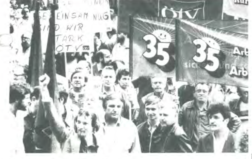
German workers marching in 1984

strike to defeat the bosses. Naturally, In the process of escalation that might lead to a general strike, we would broaden the demands of the movement to Include all the rest of the anti-union legis-