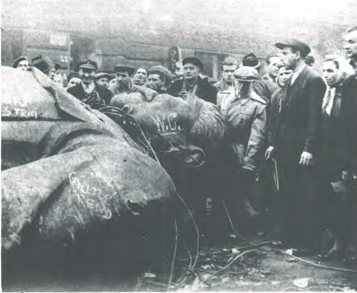
Revolutionary Hungarian workers topple Stalin's revolting statue

movement. Pablo accepted 'orthodox' amendments from the LSSP in the 1954 Congress, drawing back from the most extreme Stalinophile formulations and policies towards the 1951 positions where it was difficult for the IC to attack them.